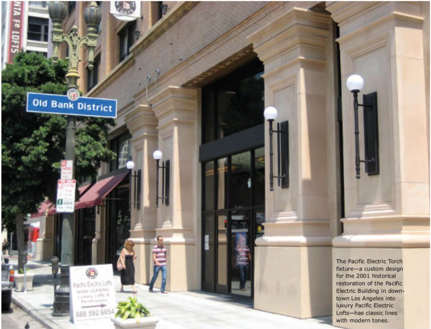
The Pacific Electric Torch fixture—a custom design for the 2001 historical restoration of the Pacific Electric Building in downtown Los Angeles into luxury Pacific Electric Lofts—has classic lines with modern tones.